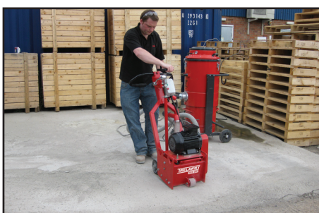
REDUCING LEVELS ON CONCRETE