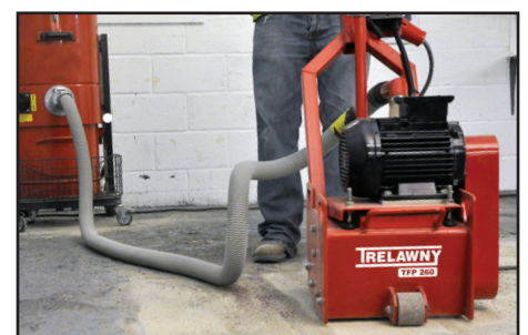
USE WITH A45 DUST COLLECTOR