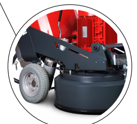
Adjustable front and rear wheels.