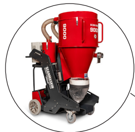
Recommended vacuum: SD9000 WS / SD8000