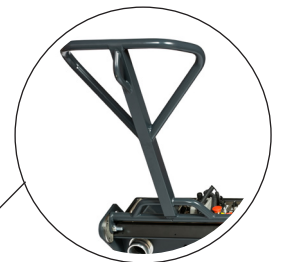
Ergonomic design that facilitates the work of the operator.